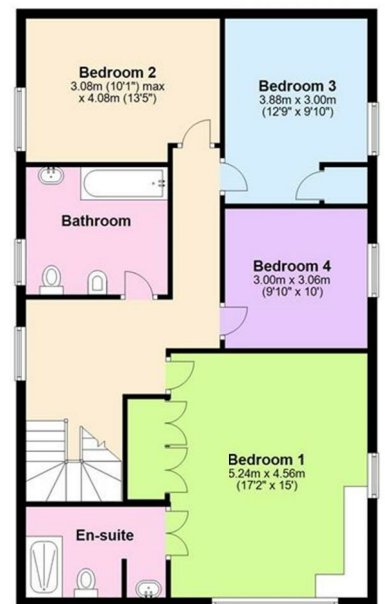
First Floor Approx. 90.8 sq. metres (977.7 sq. feet)

Total area: approx. 270.3 sq. metres (2909.4 sq. feet)